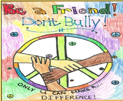
Elementary Grand Prize Winner Student from St. Johns County

The Student Poster Contest promotes the Crime Stoppers' Tip Line by encouraging students to submit original artwork depicting their idea of the anti-violence message "Make Your World, Your School, A Better Place." Winning artists receive awards and the grand prize winning posters are displayed in classrooms throughout the 7th Judicial Circuit and on VOTRAN buses. The poster contest works to motivate students to report any information they may have regarding violence that has happened or may happen in hopes of preventing potential school violence.