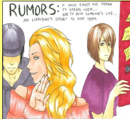
Middle School Grand Prize Winner Student from Flagler County